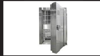
Bank Doors (Access Points)