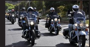
Motor Cycle Batteries