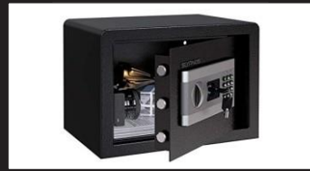
Cash In Transit Safes