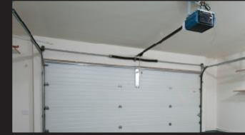
Garage Door & Gate Motor